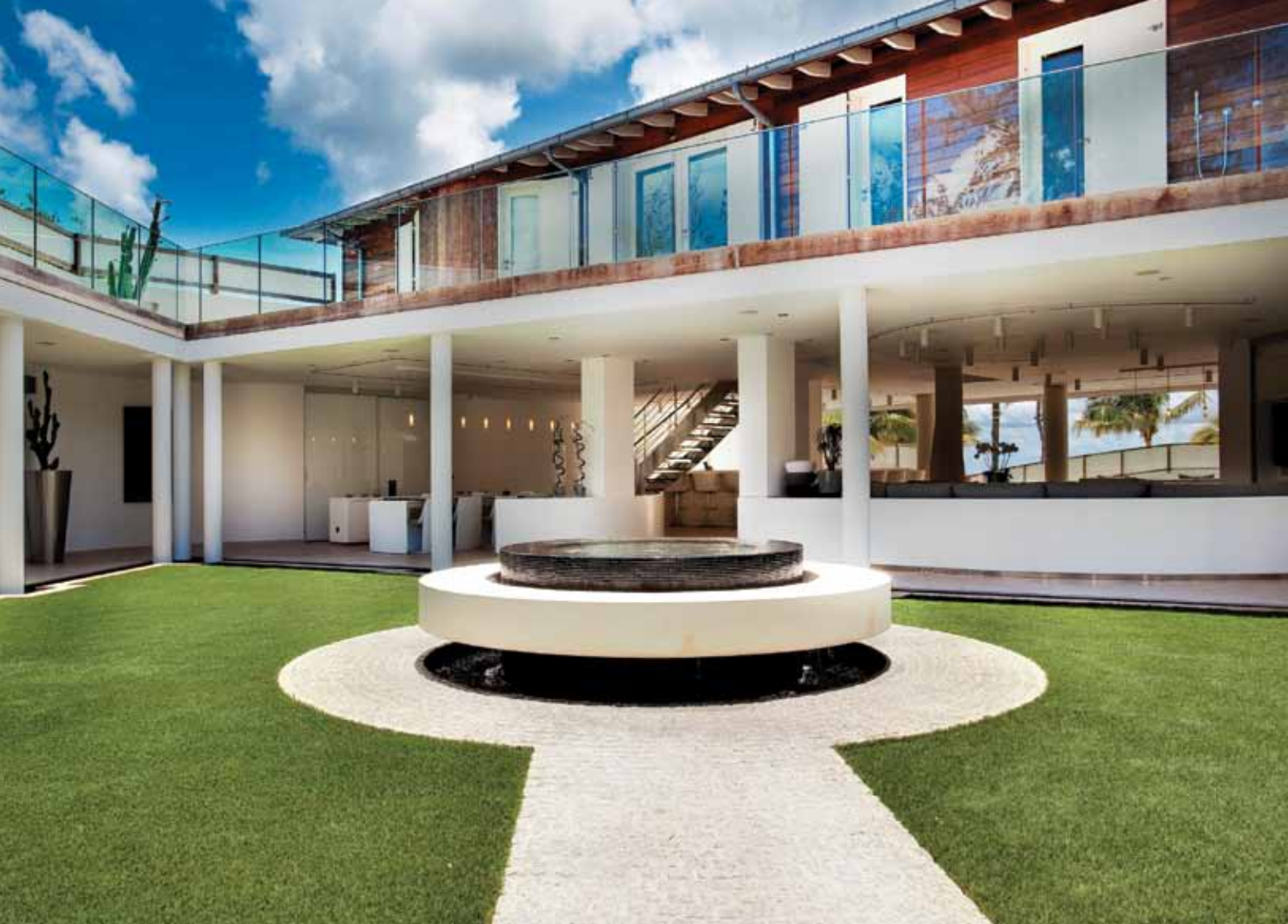
CERTIFIED PLATINUM Of the thousand or so villas on St. Barts, Eden Rock's 16,000-square-foot Rockstar, on St. Jean Beach, may be the most splendid.

Unless you frequent St. Tropez and Monte Carlo, the concentrated glam of St. Barts can be a bit head-spinning. In restaurants and bars, in shops and on beaches, celebrities are sighted here like costumed characters are at Disney World, albeit with somewhat less waving and hugging. I saw Ric Ocasek, lead singer of the band The Cars, sitting by himself on a hotel towel on glorious Anse du Gouverneur, and took it upon myself as a journalist and a fan to express my pent-up appreciation for the band's