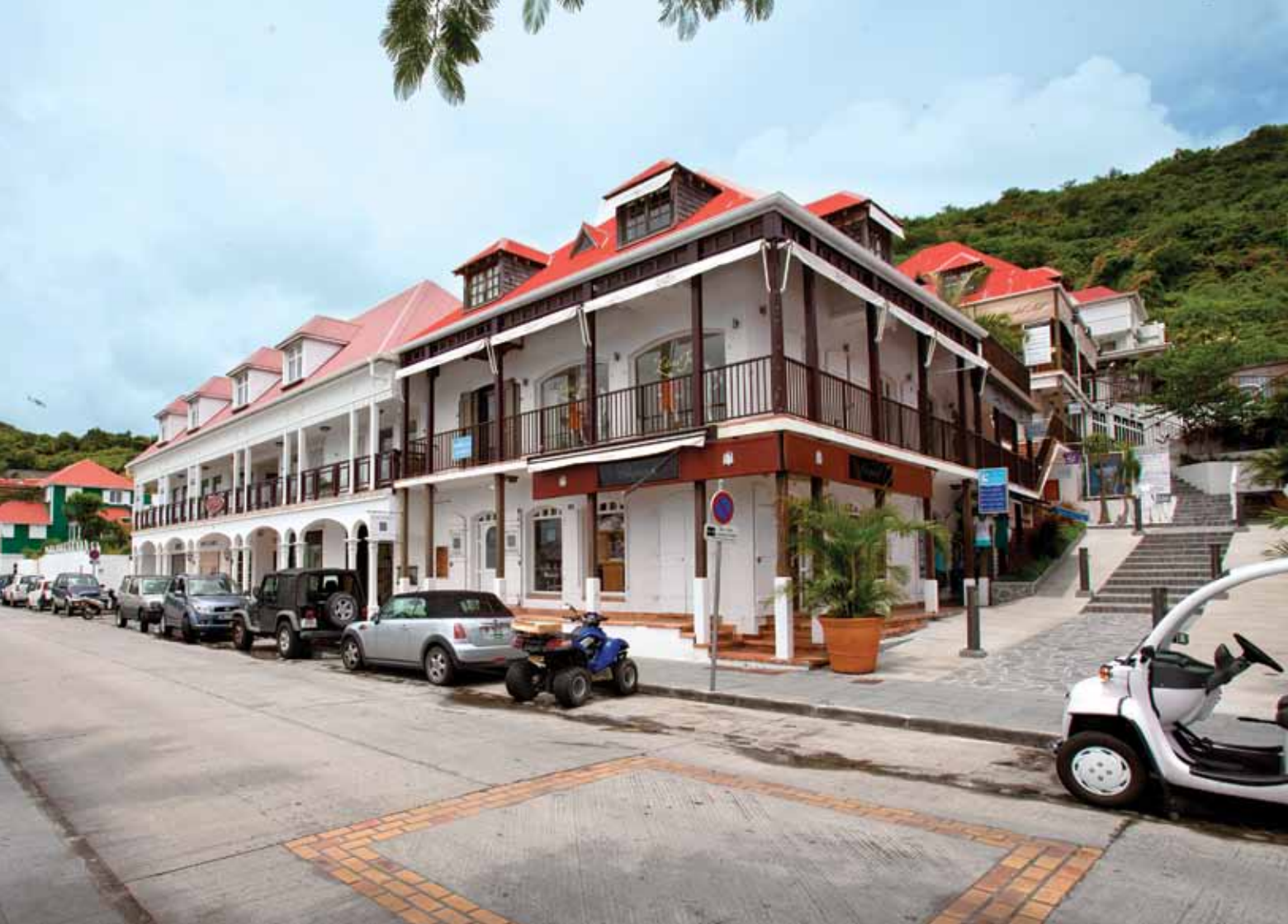
CITY + SAND Gustavia is a walker's paradise. Opposite, from left: The scene at St. Jean's happening Nikki Beach; baguettes baked fresh at La Petite Colombe.

For the uninitiated, St. Barts measures a petite 8.1 square miles. The island is craggy and rugged and has no fresh water beyond imported Evian, and though it can appear quite lush in the summertime, nothing edible grows here without the most devoted and fortunate of green-thumbers, the sort of thing the Hotel le Toiny is doing with its fastidiously tended organic greenhouse. Simply put, St. Barts is a rock. Then again, the Hope Diamond is a rock, and I'd say it's done pretty well for itself.