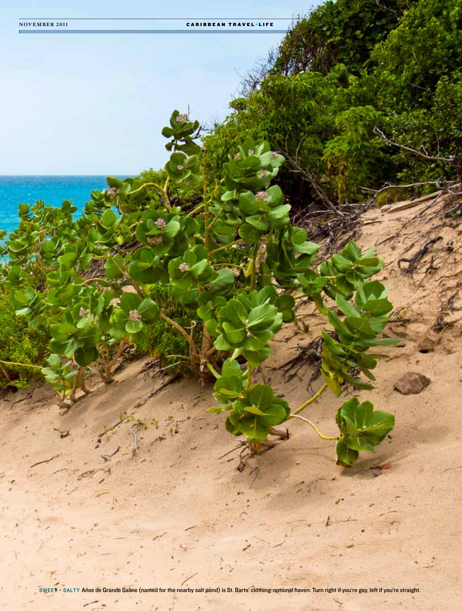
SWEET + SALTY Anse de Grande Saline (named for the nearby salt pond) is St. Barts' clothing-optional haven: Turn right if you're gay, left if you're straight.