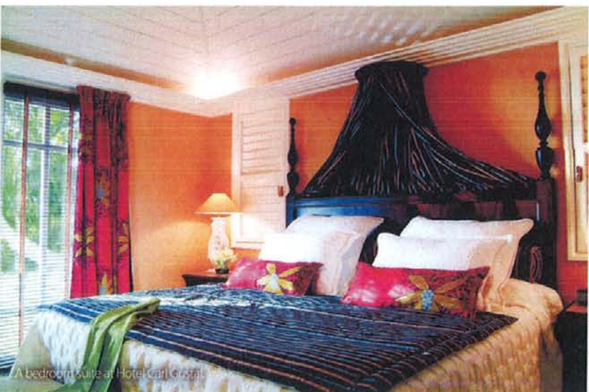
A bedroom suite at Hotel Carl Gustaf.

To dine off-property requires a taxi, and if staying more than a few days, consider a rental car.