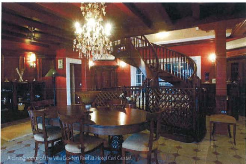
A dining room of the Villa Golden Reef at Hotel Carl Gustaf.

Contact: 800-680-0832 or www.letoiny.com , or email reservations@letoiny.com .