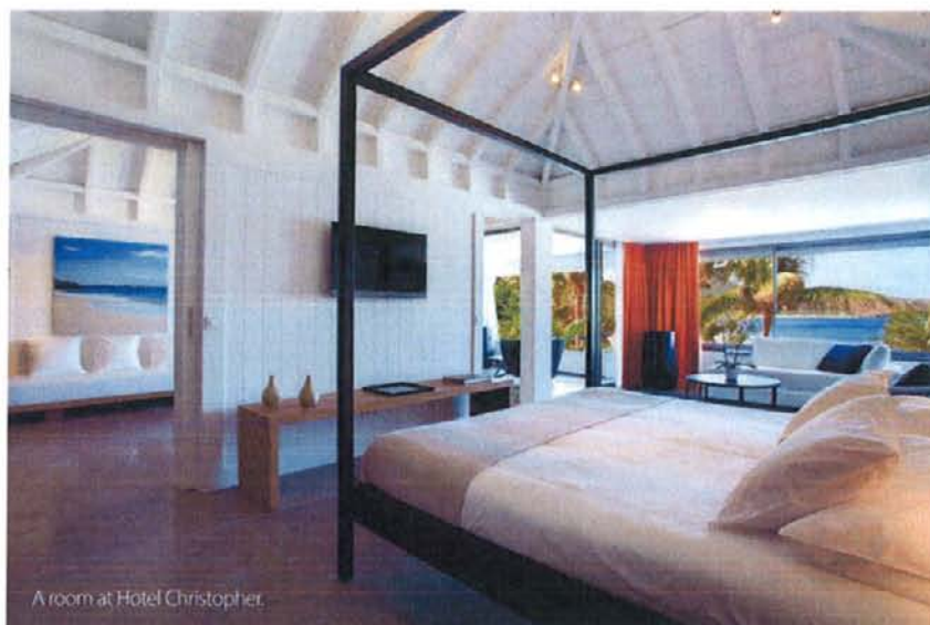
A room at Hotel Christopher.